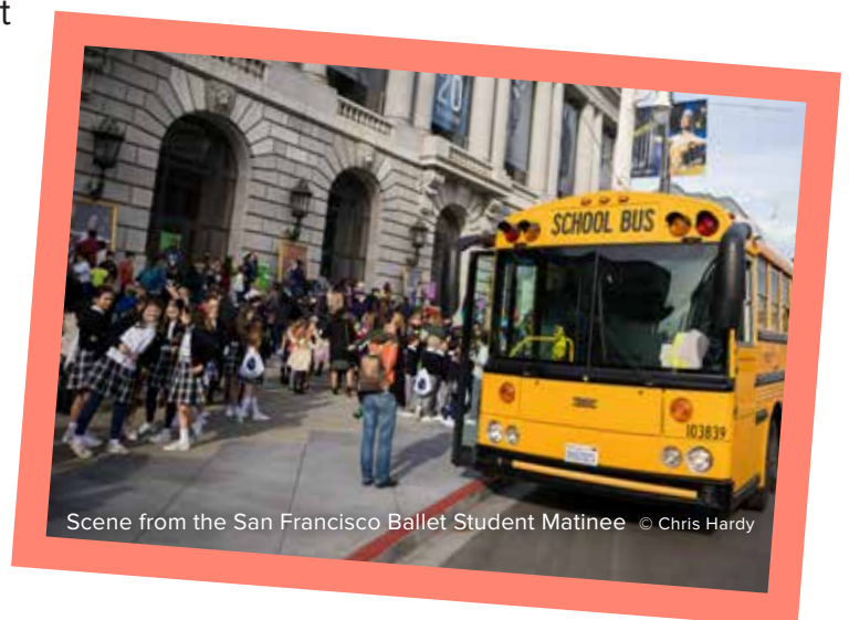
Scene from the San Francisco Ballet Student Matinee

Because of the generosity of our donors and community partners, we were able to adapt and expand our educational offerings. Donors and partners who are passionate about making dance and art available and accessible to everyone have been vital to the success of our education programs. Thank you for helping keep the DISC program going for over 40 years.